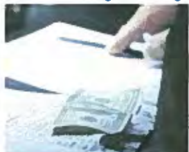
March Madness in Las Vegas.